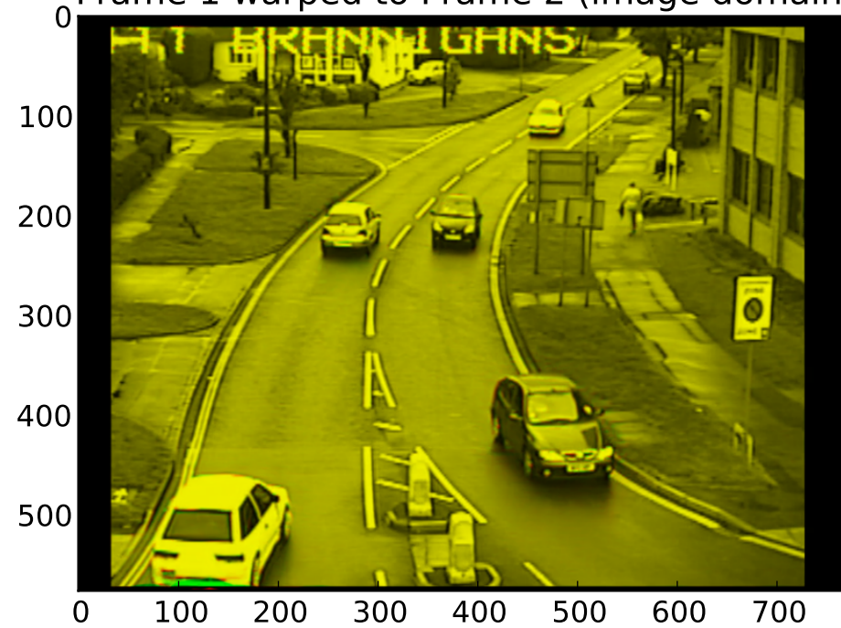
Frame 1 warped to Frame 2 (image domain)