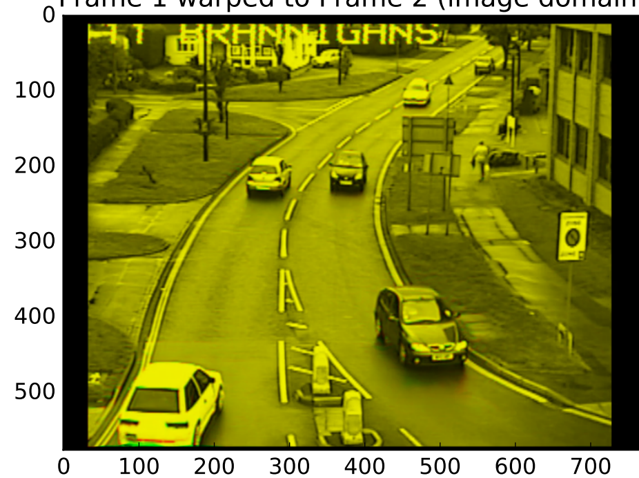
Frame 1 warped to Frame 2 (image domain)